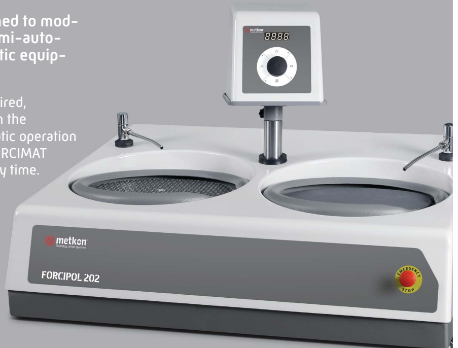
FORCIPOL 202 with Control Unit

When only manual preparation is required, FORCIPOL Control Unit can be fitted on the FORCIPOL grinder / polisher. If automatic operation is required in the future, one of the FORCIMAT automatic heads can be installed at any time.