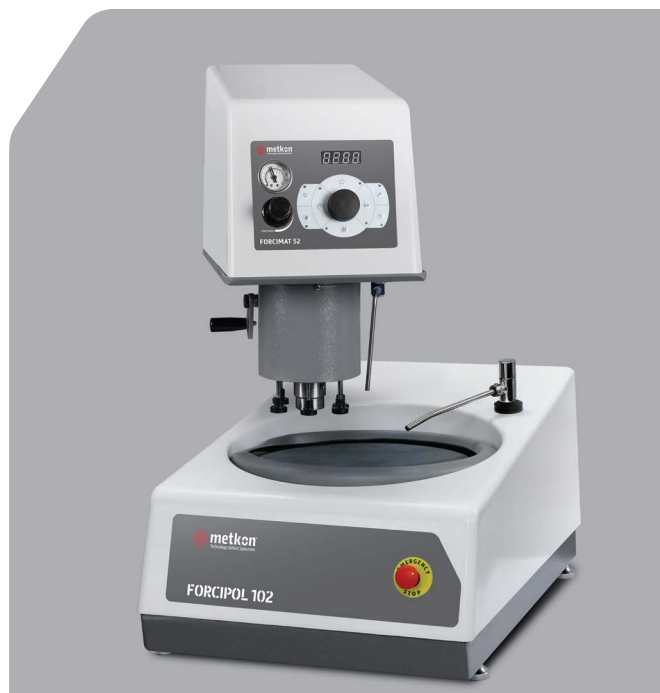
FORCIPOL 102 with Forcimat 52

FORCIMAT series of Automatic Heads are available as two types: FORCIMAT 52 and FORCIMAT 102