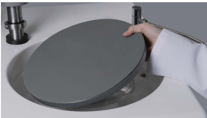
Simple exchange of working discs

The stylish and functional housing is corrosion free and easy to clean. Molded wheel bowls and drains eliminate leaks and the build-up of residue is prevented by constant flushing of the bowl. The drive elements are fixed on heavy duty aluminium alloy casting. The wheels are mounted on ball bearings allowing the application of high pressures to prepare even large specimens. Ball bearings used provide quite and vibration free operation. Water inlet and flexible water outlets with control valves for wet grinding are standard features. FORCIPOL instruments can be used for grinding, lapping and polishing with magnetic backed discs and cloths or by quick and simple exchange of wheels.