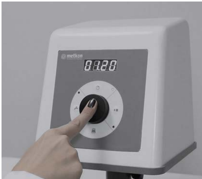
Simple Fast Control