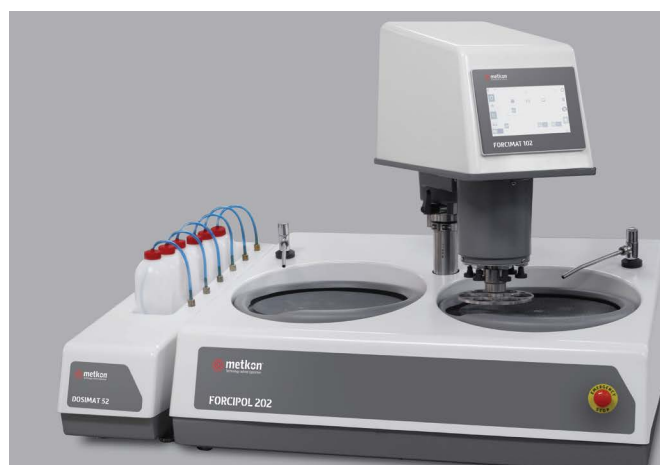
FORCIPOL 202 with FORCIMAT 102 & DOSIMAT 102

When needed, FORCIPOL 202 can work in manual mode to allow prepare specimens by hand.