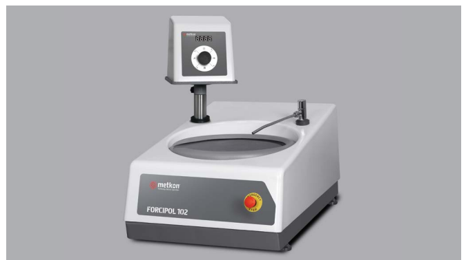
FORCIPOL 102 with Control Unit

Both single and double wheel versions are suitable with \varnothing 200 , \varnothing 250 and \varnothing 300 mm wheels. The working wheel is powered by a high torque 1.0 HP electric motor with both clockwise and counterclockwise wheel rotation possibility. The state of the art frequency converter allows smooth speed variation (50-600 rpm) of the grinding wheel with soft start and soft stop. Both. This allows the setting of the optimum speed for each individual preparation process. It is perfect choice for laboratories preparing a wide range of different materials from very small to very large.