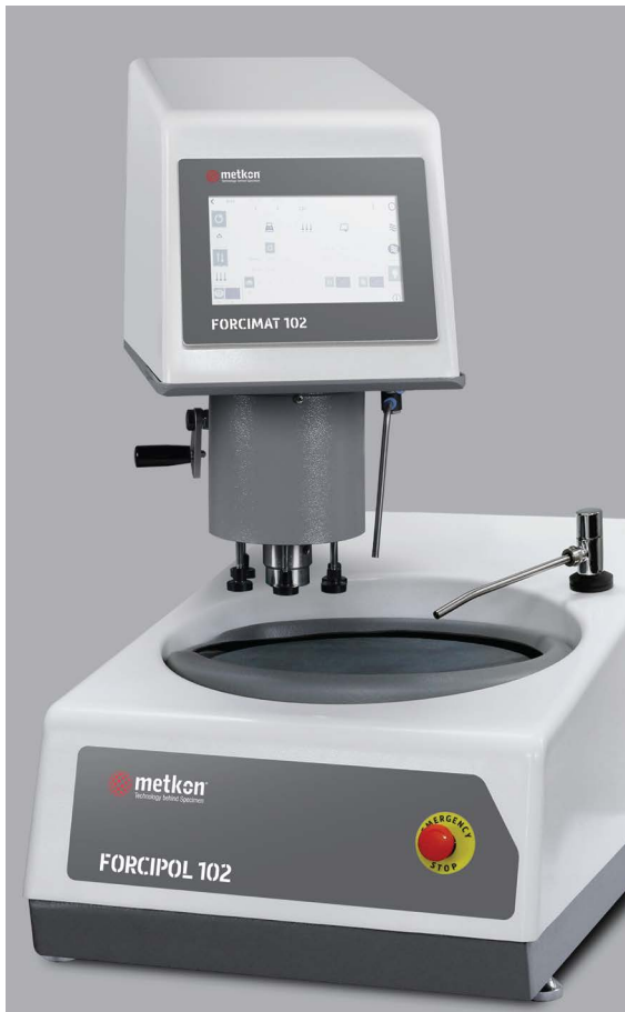
FORCIPOL 102 with FORCIMAT 102