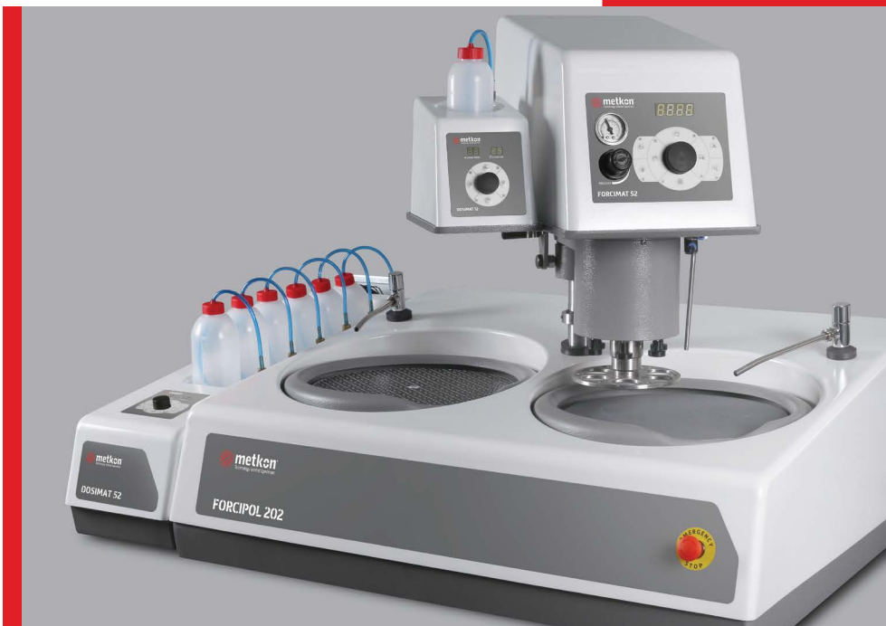
FORCIPOL 202 + FORCIMAT 52 + DOSIMAT 12 + DOSIMAT 52

Three different DOSIMAT Peristaltic Fluid Dispensers are available for FORCIMAT 52 and FORCIMAT 102: