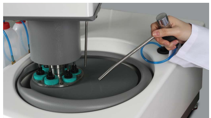
Retractable water hose for easy cleaning